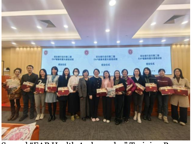
The Second "EAP Health Ambassador" Training Programme

"EAP Health Ambassador" training programme, which attracted 50 participants, including senior and mid-level managers and psychology enthusiasts from 34 departments of the Head Office. Through a combination of online guided learning and offline hands-on practice, employees gradually mastered the contents of the 10 modules, including the positioning and functions as a "Health Ambassador", daily stress management, care and management of personal issues, application of counselling techniques, prevention and identification of psychological risks, practical techniques and practices for heart-to-heart conversations, and identification and response to workplace health risks. This programme has created an internal part-time EAP service team and extended psychological care services to the primary-level.