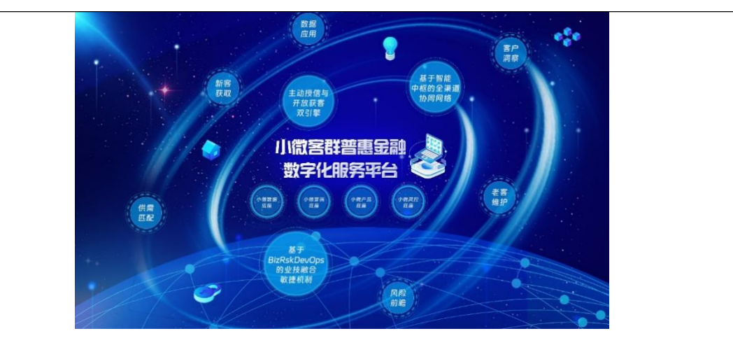
Digital Service Platform for Inclusive Finance for the Small Business Customer Group