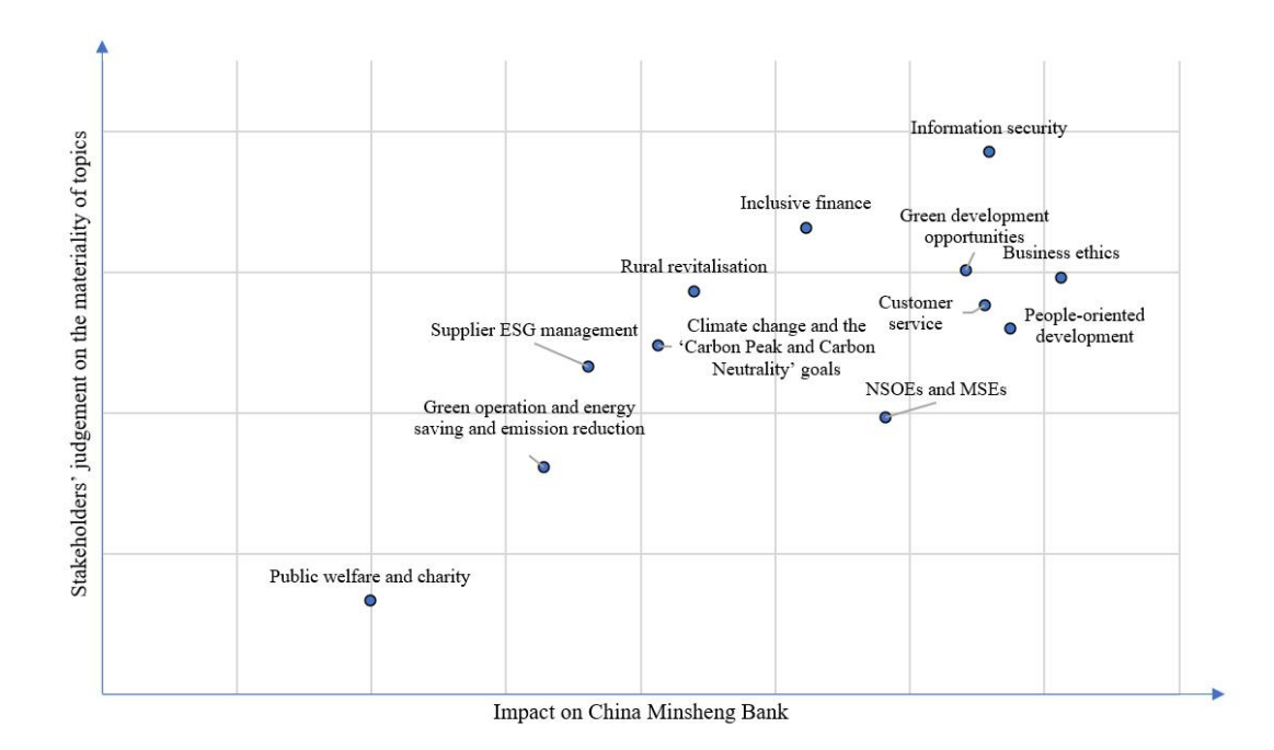
2024 China Minsheng Bank Material ESG Topics Matrix