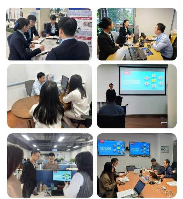
Training Programmes for High-Quality Management Capability Enhancement

Developing leadership and management capability. The Bank launched a series of high-quality management capability enhancement training projects, which focused on key management areas designed and implemented layered and classified management capability enhancement plans for executives, mid-level managers, and high-performing young employees, to effectively improve performance ability of employees at all levels.