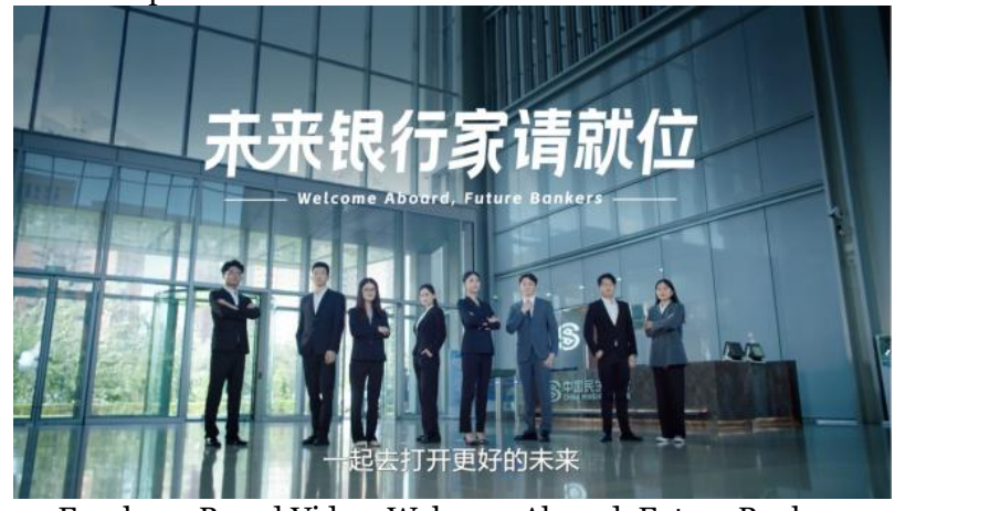
Employer Brand Video: Welcome Aboard, Future Bankers

In order to strengthen the campus recruitment branding, enhance the brand influence of the "Future Bankers" programme in campus recruitment and enhance the attractiveness of outstanding graduates, in August 2024, the Bank produced an employer brand video, to systematically introduced the policies for independently cultivating young talents and demonstrated the growth paths and opportunities available to them at China Minsheng Bank. Through continuous employer branding efforts, the "people-oriented" management culture was deeply rooted in people's mind, making the Bank's employer brand more appealing. In recent years, the Bank witnessed a steady increase in both the quantity and quality of campus recruited graduates, thereby laying a solid foundation for talent selection in campus recruitment.