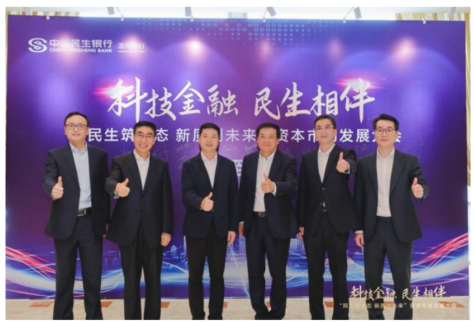
"Minsheng Sci-Tech Finance" Marketing Service Activities

In 2024, China Minsheng Bank continued to carry out a series of marketing service activities themed "Minsheng Sci-Tech Finance", aiming to offer comprehensive services across lifecycle to sci-tech enterprises. Through cooperation with governments, parks, PE/VC firms and other partners, the Bank has hosted over 230 events, which covered distinctive products and all-scenario services, ecological channels empowerment and investment and financing roadshows, capital market professional counselling and support for the going global of enterprises' industrial chains, campaigns at the Shanghai Technology Exchange and various regional sci-tech parks, and events at the Global Entrepreneurship Forums and sci-tech enterprise patent competitions, and all achieved satisfying results.