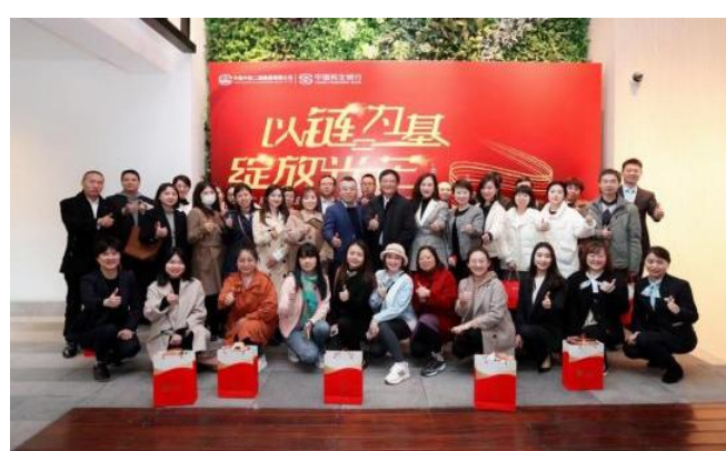
Supply Chain Finance Series Events Themed "Supply Chain-Based Development"

The Bank comprehensively applied the "E-Credit Finance", an innovative product in the supply chain. By leveraging internet technologies and the bank-enterprise direct connect, the Bank relied on the credit and data enhancement of core enterprises to provide comprehensive, transparent and fast electronic accounts receivable management and low-cost financing services for upstream suppliers. Through batch account opening and centralised disbursement, the service efficiency was comprehensively improved. Through these initiatives, the Bank not only effectively alleviate customers' pressure on payment of accounts payable, but also guaranteed the payment needs of customers and the financing needs of suppliers.